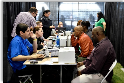
Stand Down Services