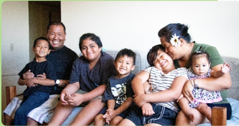
Individuals in Households Households

of homeless mothers experienced multiple traumatic events with violent victimization being the most common, according to a national study.